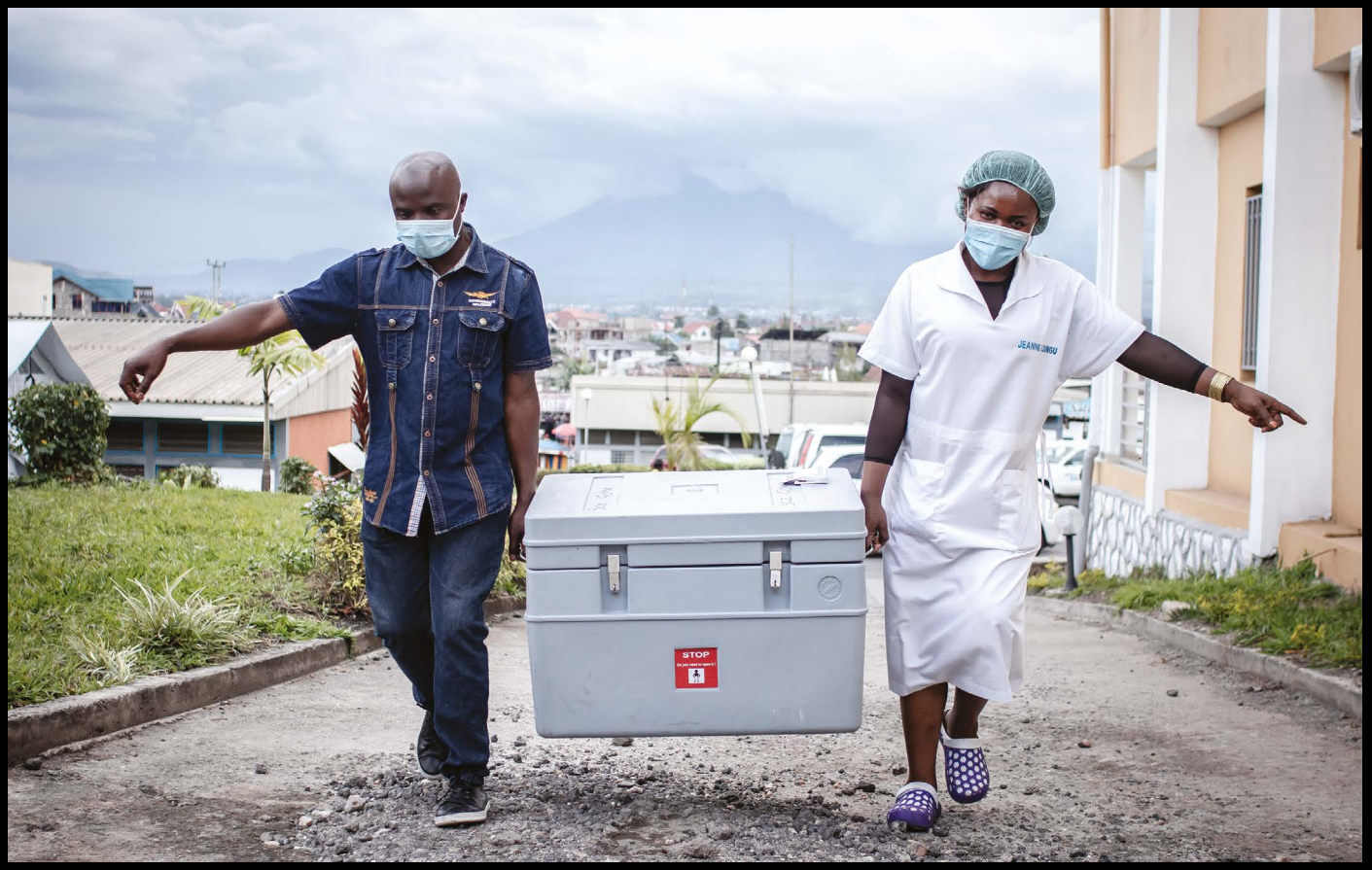
A campaign to vaccinate people against COVID-19 in Goma, Democratic Republic of the Congo, in May.