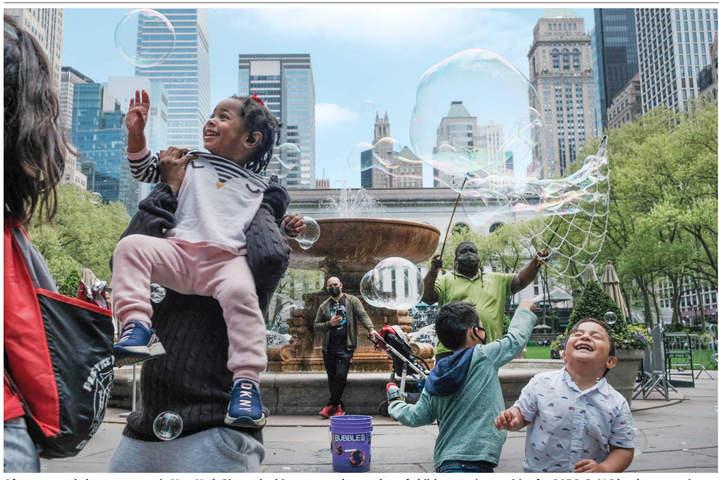
After extremely low case rates in New York City early this summer, the number of children testing positive for SARS-CoV-2 has begun to rise.