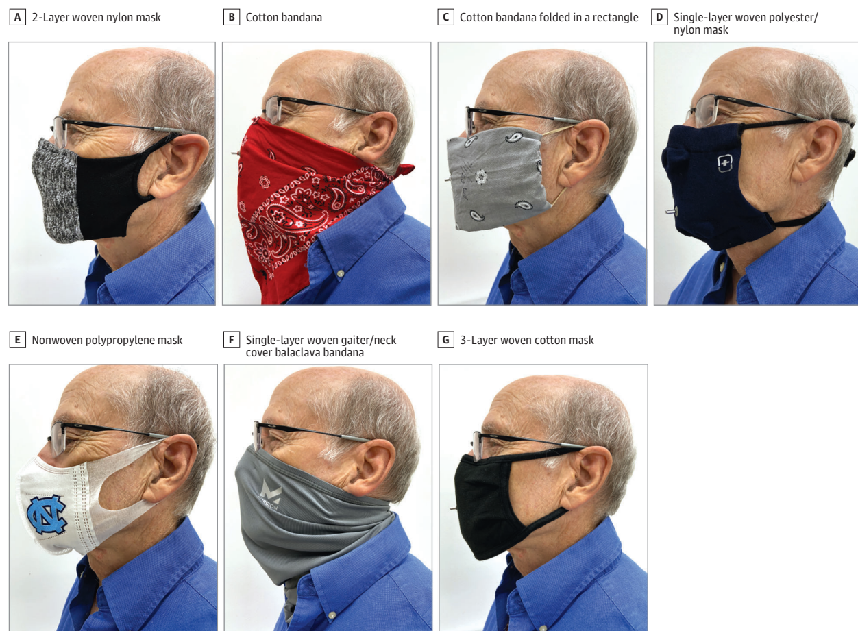
Figure 1. Consumer-Grade Masks and Improvised Face Coverings

The face coverings tested in this study included a 2-layer woven nylon mask with ear loops (54% recycled nylon, 43% nylon, 3% spandex), tested with and without an optional aluminum nose bridge and nonwoven filter insert in place (A), a cotton bandana folded diagonally once “bandit” style (B), a cotton bandana folded in a multilayer rectangle according to the instructions